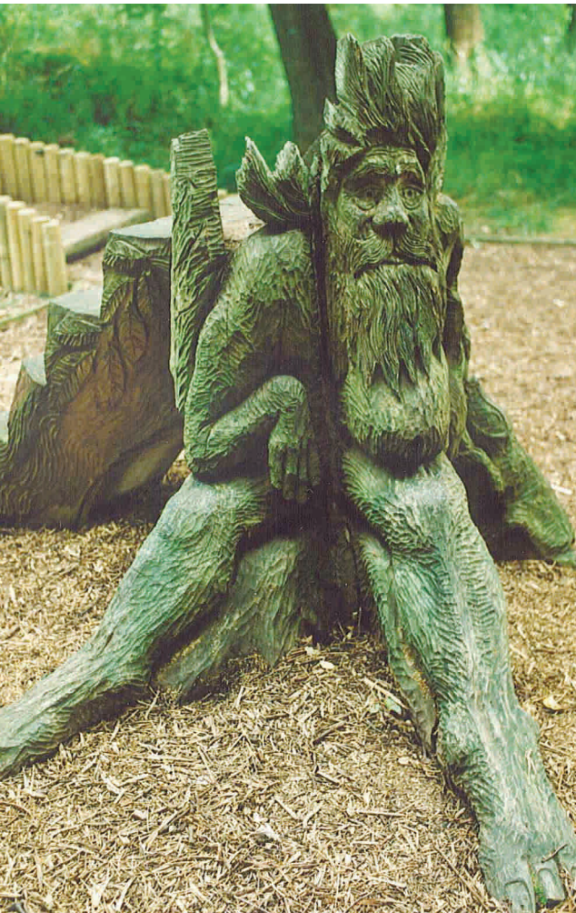
Tree sculpture at Teversal Visitor Centre

This visitor centre is run by volunteers and is usually open all year round. With lots of space for parking it is an ideal starting point to get onto the Silverhill, Pleasley and Teversal Trails and a good place for a cup of tea when you have finished!