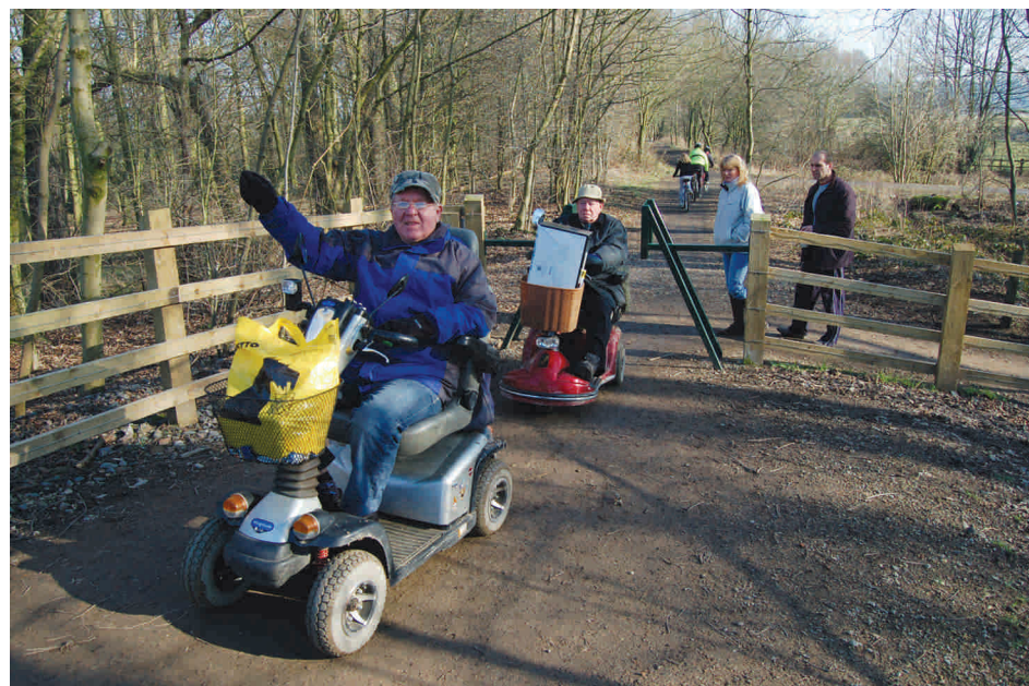
Many of the trails are access-for-all friendly.

This trail was one of the many railway tracks crossing the area, linking the collieries to the main line. The closures of the pits and railways have given us a dramatically changed landscape. We now have trails and country parks, a greenway network and links from villages into the countryside.