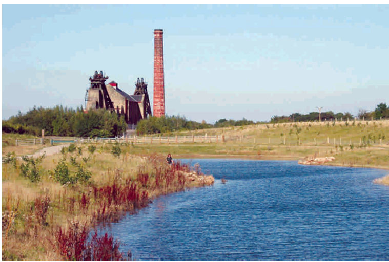
Pleasley Pit Country Park

This country park has an amazing variety of habitats. This gives nature lovers the chance to spot many different birds, dragonflies and damselflies. Through the spring and summer there is an array of wildflowers, including increasingly rare orchids. In dramatic contrast to the country park you will see the remaining pit buildings which are now a Scheduled Ancient Monument (SAM).