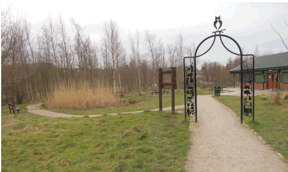
The visitor centre at Brierley Forest Park

There are routes around the park for walkers, cyclists and horse riders and easy access routes suitable for scooters, prams and wheelchairs. The visitor centre here is open all year round and offers information, exhibitions and refreshments.